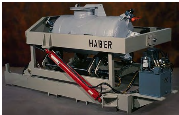
Figure 138. HABER GOLD PROCESS A mobile test unit for the Haber Gold Process (HGP).

The Haber gold process (HGP) was developed by Norman Haber of New Jersey for hardrock gold ores, but it has potential for placer gold recovery. The HGP is a chemical leaching process using a non-toxic lixiviant (extracting solution) of proprietary composition. Haber Inc (www.habercorp.com) says the chemicals used are “readily available”.