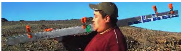
Figure 146. POPANDSON SLUICE Carrying a standard over-the-shoulder PopandSon sluice in the Gobi Desert of Mongolia.